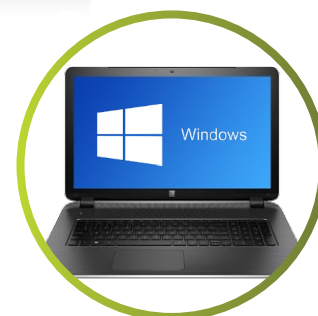
Control software for Windows OS