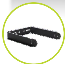
U bracket included