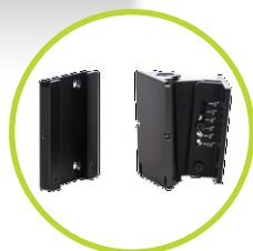
Compatible with RF UB universal mounting bracket