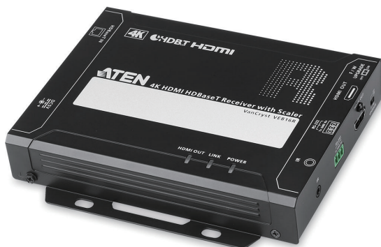
VE816R Rear View