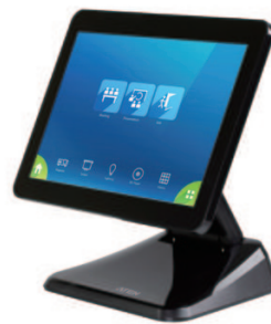
VK330 + VK304