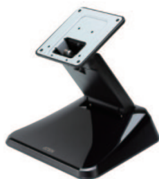
VK304 (Tabletop Kit)