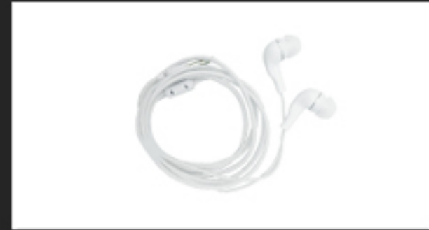
Model ; ER01 Standard Ear phone