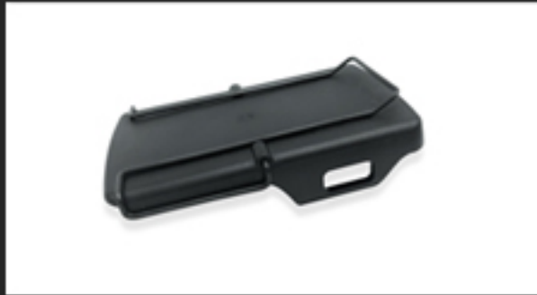
Model ; BC-01 Belt Clip Cradle