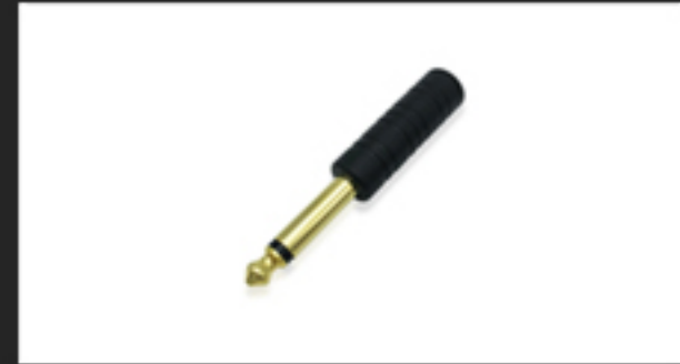
Model ; RCA01 RCA Adapter