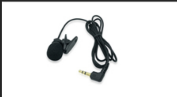
Model ; CM01 Clip type Microphone with 1.2m cable