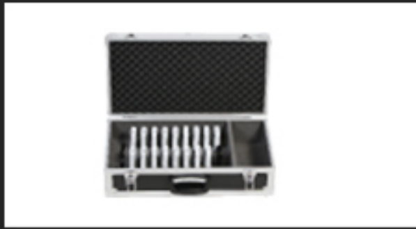
Model ; CB20D Drop in Charging container for 20 units Input;AC100~200v, Output;DC5V/5A Charging current/Time;220mA typ. / 6 Hour Dimension;54x28.5x15cm Weight;4.6kg without units