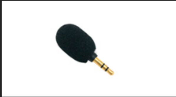
Model ; PM01 Plug type Microphone