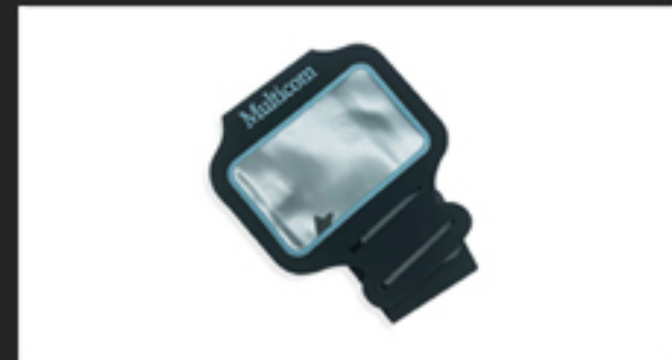
Model ; AM01 Arm Band Holder Breathable fabric with stretch