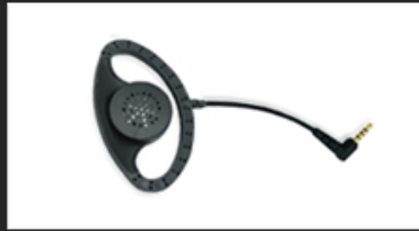
Model ; EHE01D Super Sound Quality Ear Holder Type Ear phone