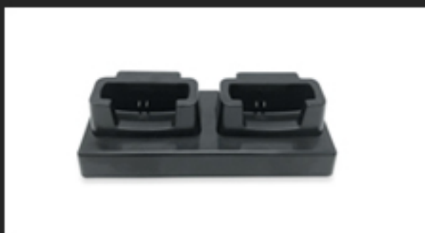
Model ; CS-02 2 Bay Drop-in Charging Cradle