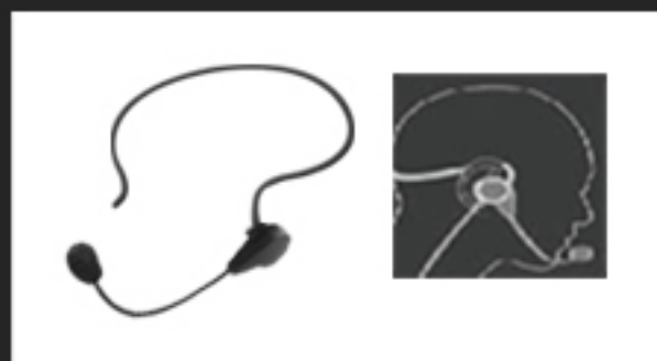
Model ; EHR01 Ear Head-Set with Boom Microphone