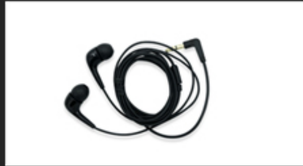
Model ; ER01B Super sound Quality Ear phone