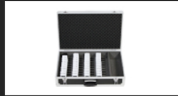
Model ; CB40D Charging container for 40 units Input;AC 100~220V, Output;DC 5V/5A Charging current/Time; 220mA typ. / 6 Hour Dimension; 63 x 42 x 15cm Weight; 6.1kg without units