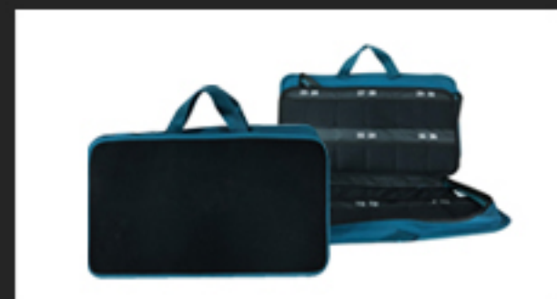
Model ; CB-48 Carrying Bag for 48 units