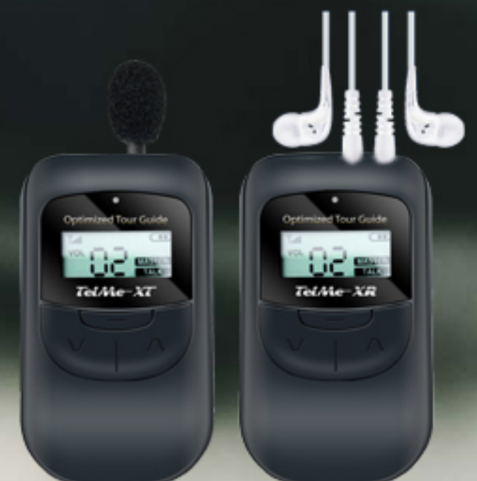
TelMe - XT