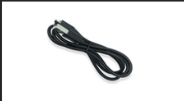
Model ; UC01 USB Charging Cable