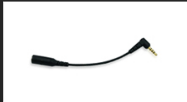
Model ; EC01 Extension Cable