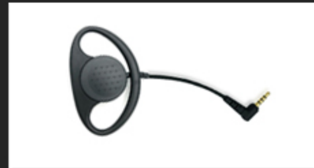
Model ; EHE01 Ear Holder Type Ear Phone