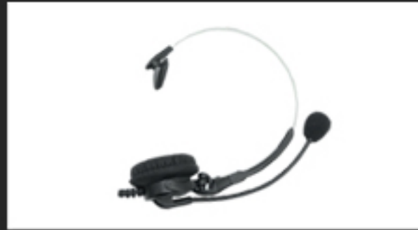
Model ; HSB-01 Head set Boom Microphone