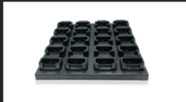
Model ; CS-20 20 Bay Drop in Charging stationary