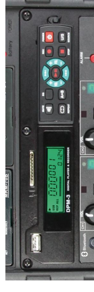
detachable DPM-3 remote-control