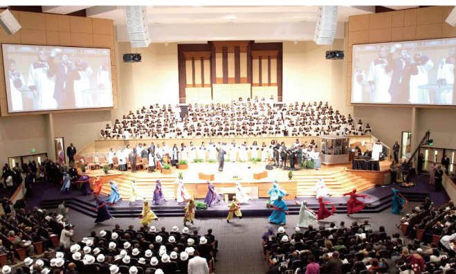
Houses of Worship

Digitally encrypted technology enables secure audio transmission, preventing unauthorized listening. Digital design provides crystal-clear audio quality, interference-free from Bluetooth, Wi-Fi and 2.4GHz wireless transmission and unmatched by the deficiency of simple analog design systems. Digital technology ensures every word can be heard clearly especially at places with noisy environments.